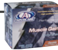
Muscle Gain Shake