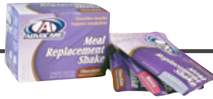
Meal Replacement Shake