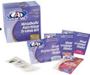
MNS Kit (MNS, shakes, spark)

Prep Phase: 10-day system to remove toxins and prepare you for the best results during the next phase (see below.) Great energy and muscle toning, as well.